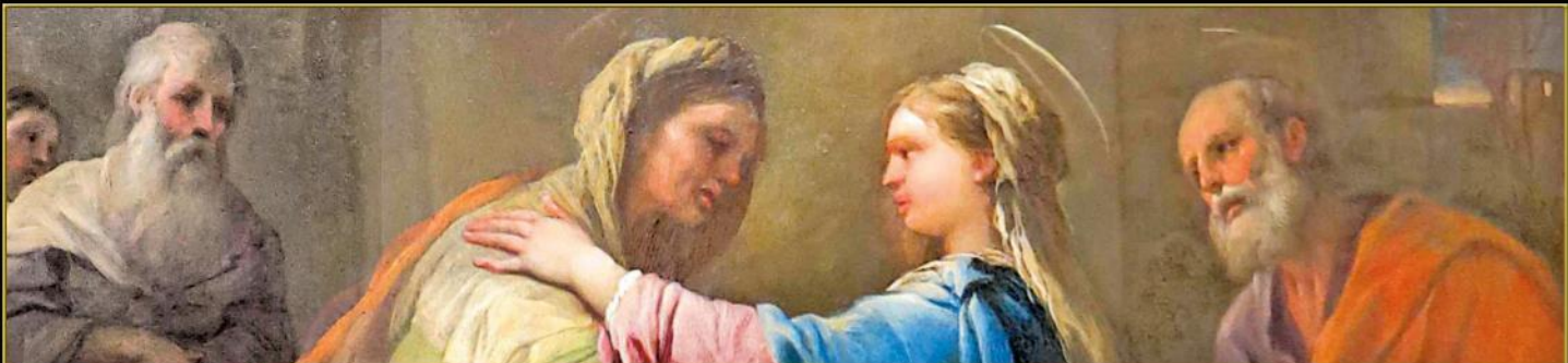
The Visitation (1696) - Luca Giordano

He will baptize you with the Holy Spirit.